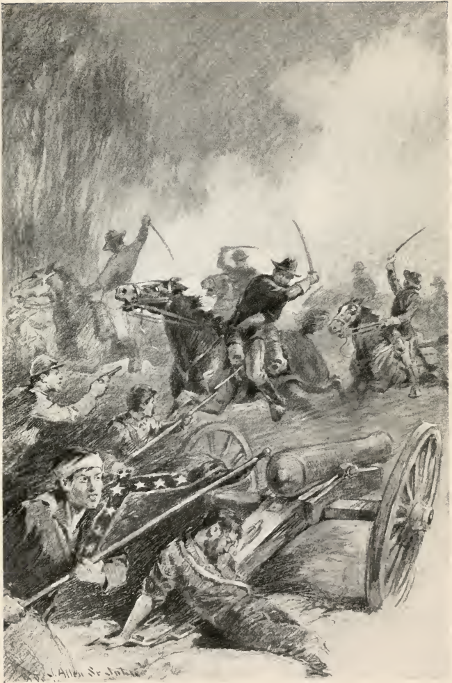
Custer's men swept over the rebel works like a whirlwind